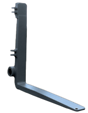
Hydraulic Attachment Fork