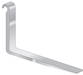
Quick Disconnect Fork